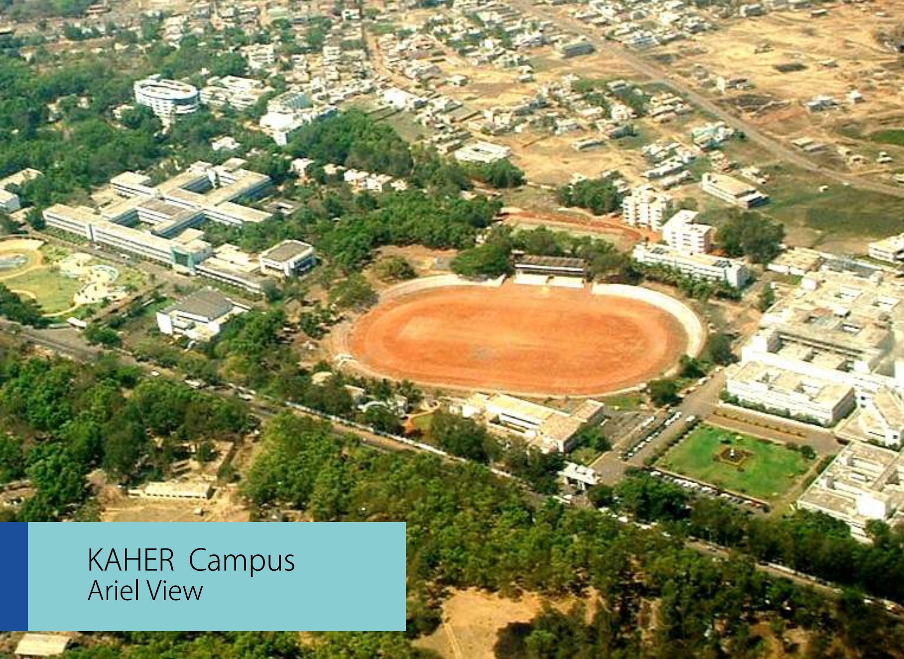
KAHER Campus Ariel View