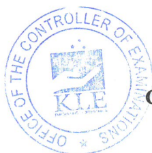
Controller of Examinations