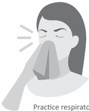
Practice respiratory hygiene