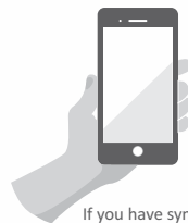
If you have symptoms seek medical care immediately