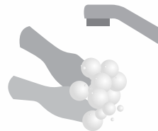
Wash your hands frequently