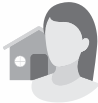
Stay at home, if you feel unwell