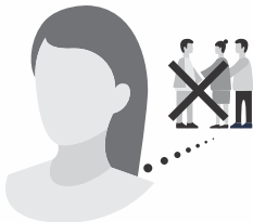
Avoid crowded places, maintain social distancing

The PG Students residing in hostel should not leave the hostel after 8 pm except those on duties.