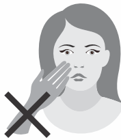
Avoid touching eyes, nose & mouth